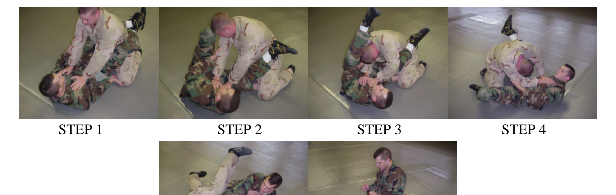
STEP 5 STEP 6