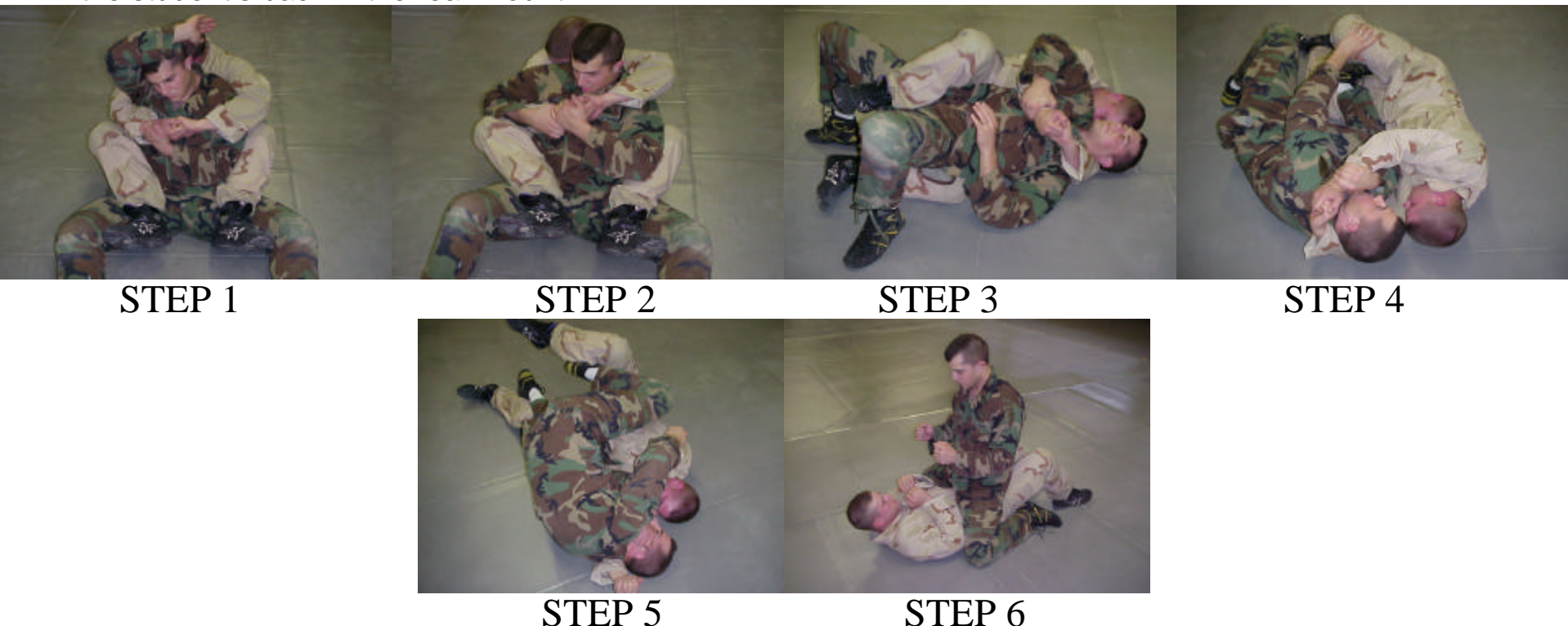
STEP#1. The Student must place an arm beside his own ear as shown. With the free hand he will gain hand control of the enemy's arm that is under his arm that is up.

Escape the rear mount - This technique begins with the Student face down the enemy is on the student's back in the rear mount.