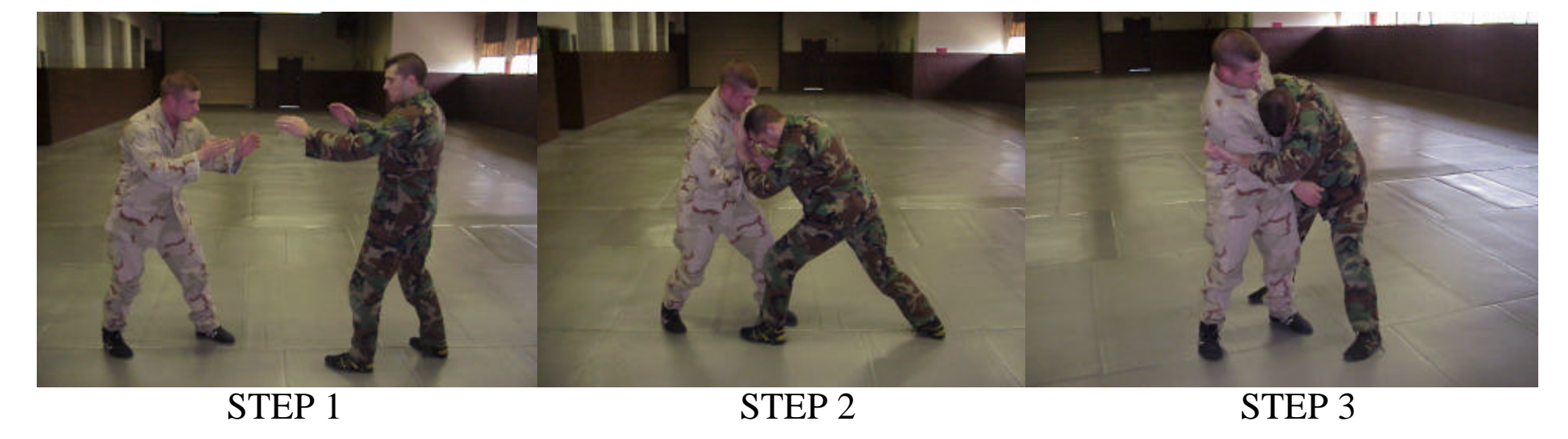
STEP #1. The Student finds himself in a combative situation. The Student should take up the fighters stance.

This technique not only has the above three elements but also has the added benefit of fostering an aggressive style for standup fighting.