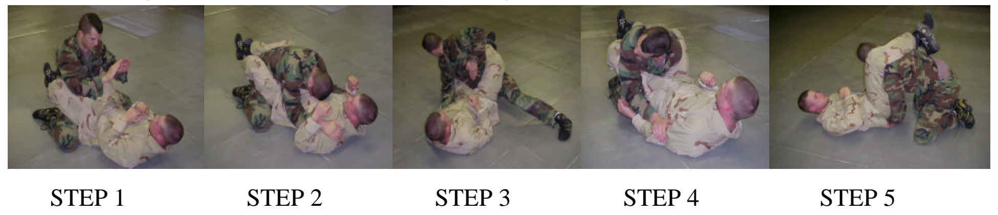
Pass the guard - The Student is within the enemy's guard.

STEP #1. The Student will defend from enemy strikes by forming a lazy V with hands 8 to 10 inches from face.