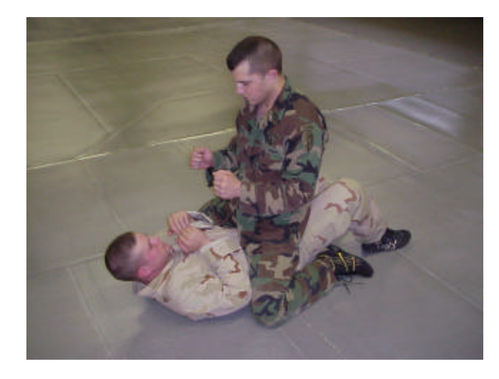
Rear Mount Mount